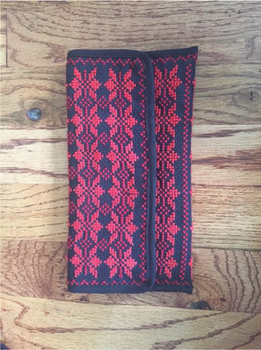
By Nicole Bindler October 9, 2015