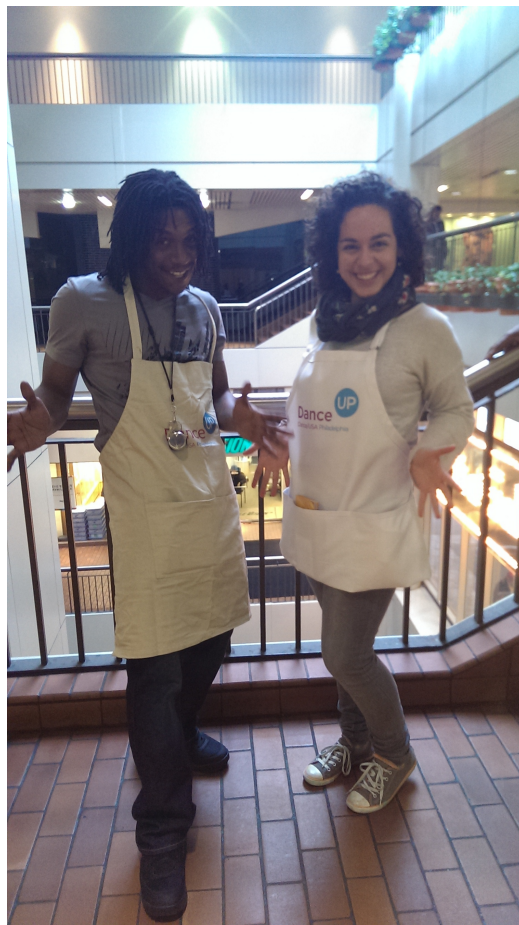
Two DiPP Ambassadors

I think the level of energy it requires is incredibly useful to me. A trap that I get into in the studio is sloth, for sure. So to feel the pressure to be always moving produces something in me and my collaborators that I don't get at Mascher [Space Cooperative]. Like a different petri dish to be growing cultures in.