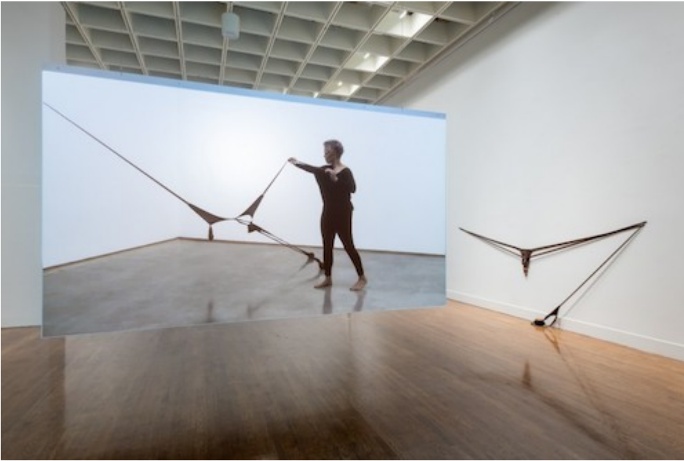
Video performance, 2014, White Cube Bermondsey, London, Photo: Joseph Hu

In the only large-screen video of a R.S.V.P. -engaged performance, an eight-minute recording from 2014 filmed at a London art gallery, Hassinger, costumed in the same brown shade as the nylon, creates a duet with the abstracted, linear forms of nylon stretched to the walls and floor. She expands upon these with shapes from her torso and extended limbs as she folds under and around the nylon, releasing a nylon segment to heighten her own body's extension, and at one point disappears under a brown cloak, forming one object or being.