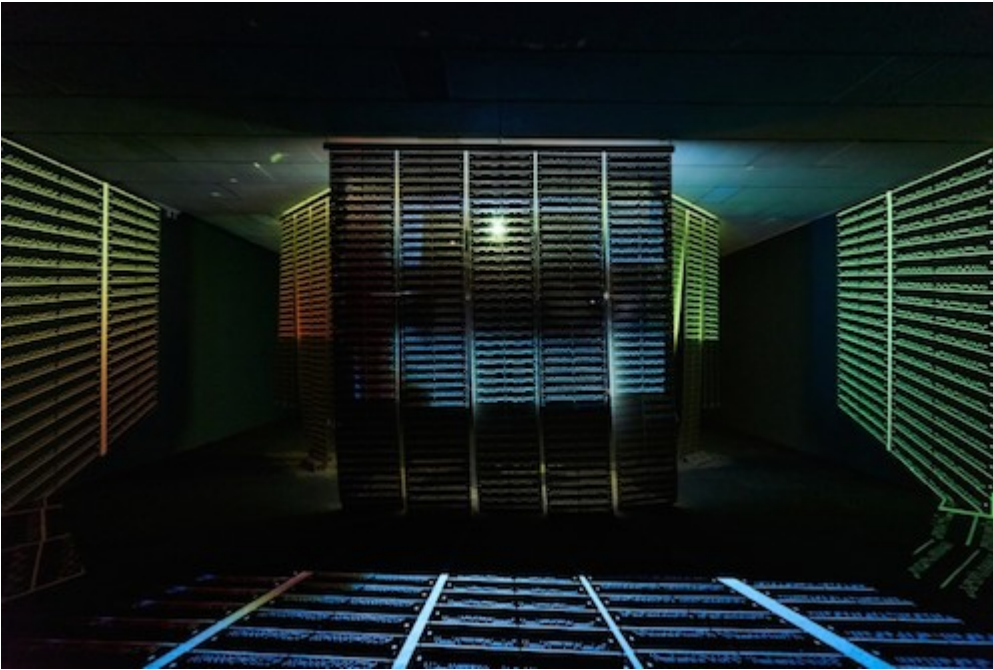
“Warp Trance”, 2007

Warp Trance , the final tour de force installation that radiates the dynamism of machines in motion, is a hypnotic video (Nengudi’s first), coming out of a 2007 artist’s residency at Philadelphia’s Fabric Workshop and Museum . Researching local textile mill machine weaving processes, and repurposing the Jacquard punch card panels that, pre-computer, programmed the weaving and patterns of the manufactured textiles, Nengudi projects video of the weaving processes onto three large screens of hundreds of these perforated punch cards. The waves, flutters and jiggles of machines and threads in motion create rhythmic dances of colored light and activated machinery, and also project a layer of inscrutable hieroglyphics from the punched cards. The results are captivating and meditative.