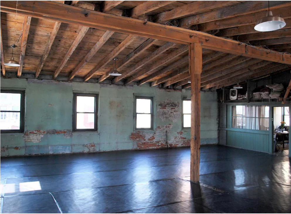
The Iron Factory, Photo: Tori Lawrence

KJS: In what ways will the closure of your studio impact Philadelphia dance and the larger creative ecosystem of the city?