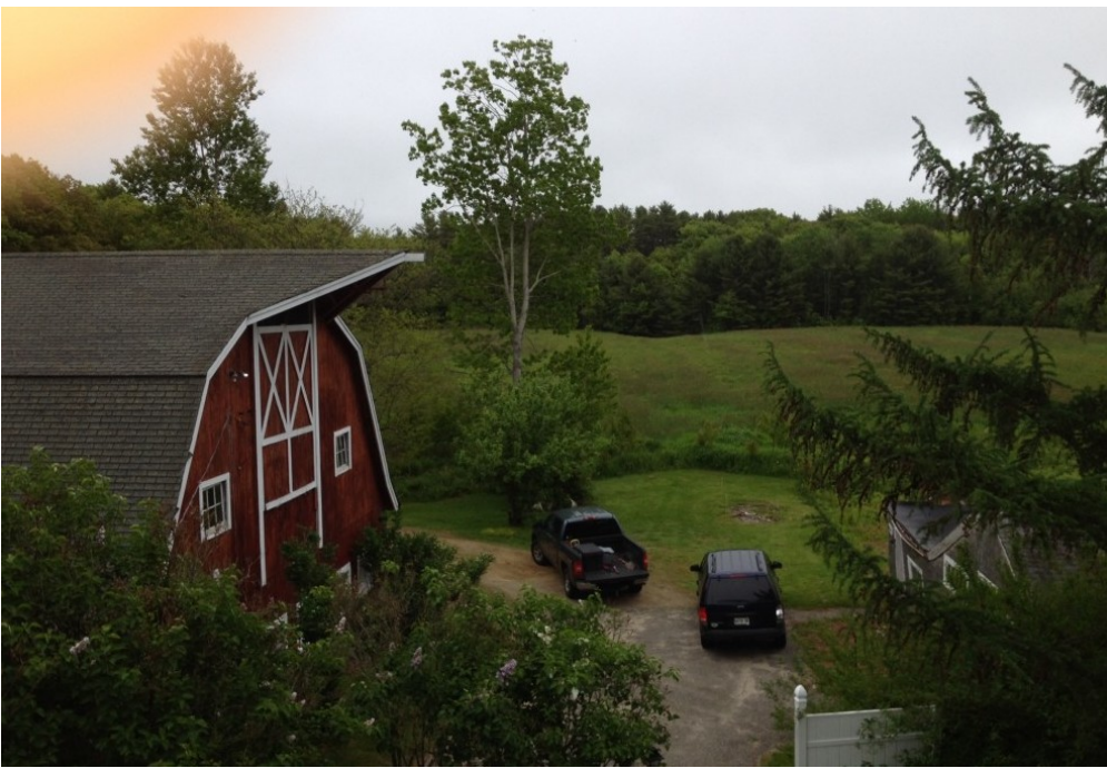
Photo from the house of the barn and

property in Biddeford, ME.