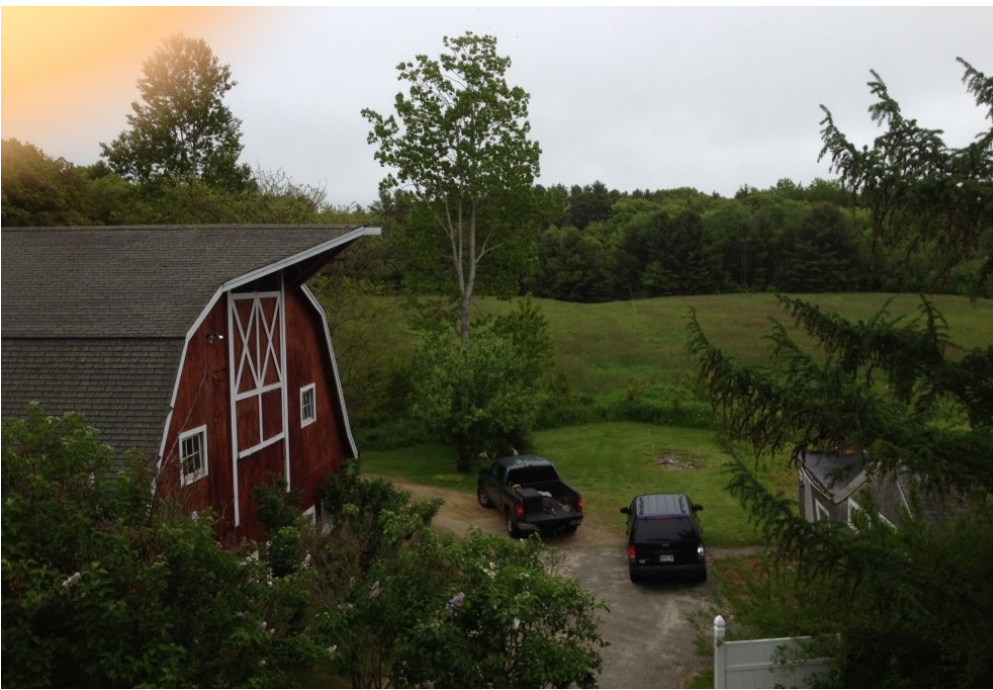
Photo from the house of the barn and

property in Biddeford, ME.