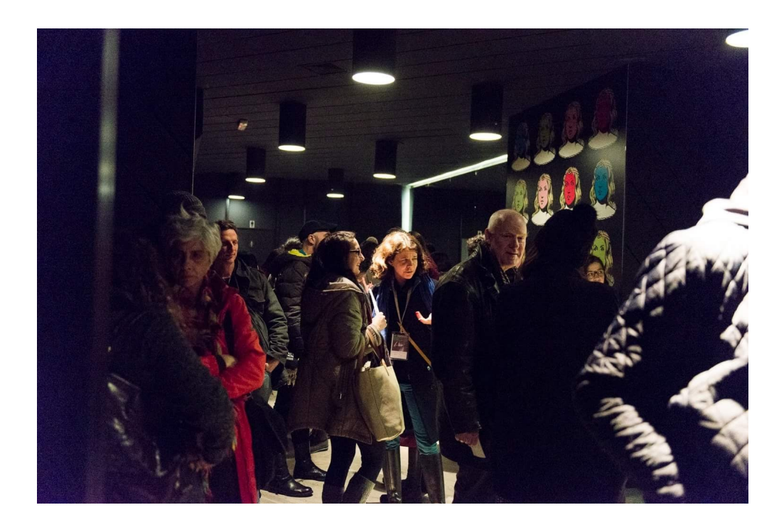
Waiting for a show to start at DNK space.

On a walk between shows I got a chance to talk to with a few other presenters. Some, including myself, felt intrigued and confused by the showcase. In the U.S., where contemporary performance has gone through the Judson era and moved toward activism, I couldn't watch these shows without thinking about gender disparity and the politics of the body. The aesthetics of some of the performances were reminding me of classic modern dance, yet there was something new, unnamed, and specifically Eastern European. Knowing that some Bulgarian artists are dismissive of U.S. work because they perceive it as only about gender and race, I am curious about how and if an overall national aesthetic would develop. Would work in Bulgaria be focused only on the emotional content in the body, or would it ever address the problematic politics, gender, and race disparity locally and globally?